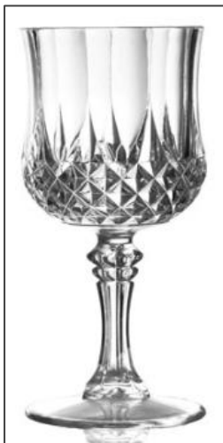
Photo: Crystal glass