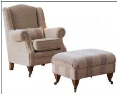
Photo: wingback chair with ottoman